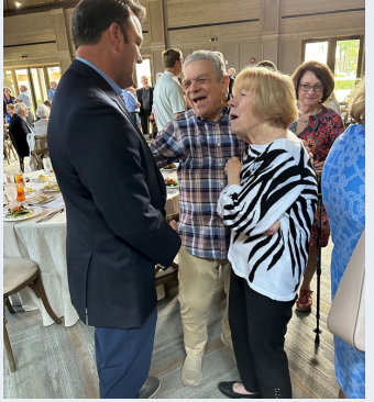
Greene County Chamber of Commerce