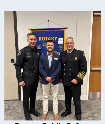
Canton Public Safety Appreciation Luncheon