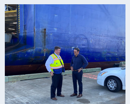
Port of Brunswick