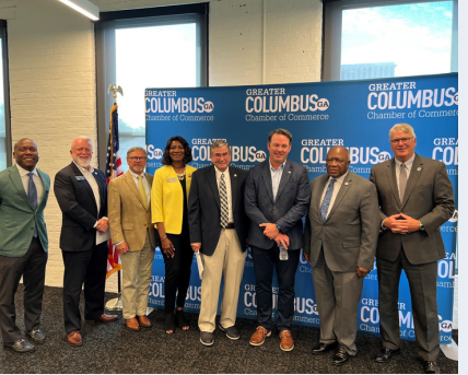
Columbus Chamber of Commerce