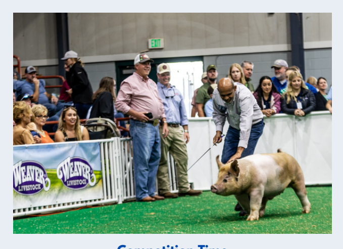
Competition Time Senator Sheikh Rahman (D - Lawrenceville)